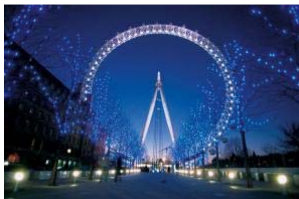
Wheely fun: The 135m-London Eye